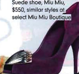
Suede shoe, Miu Miu, $550, similar styles at select Miu Miu Boutique