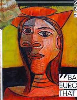
FEMME AU CHAPEAU BY PICASSO, ONE OF SHEPPARD'S FAVORITE ARTISTS