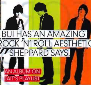
Paolo Nutini these streets